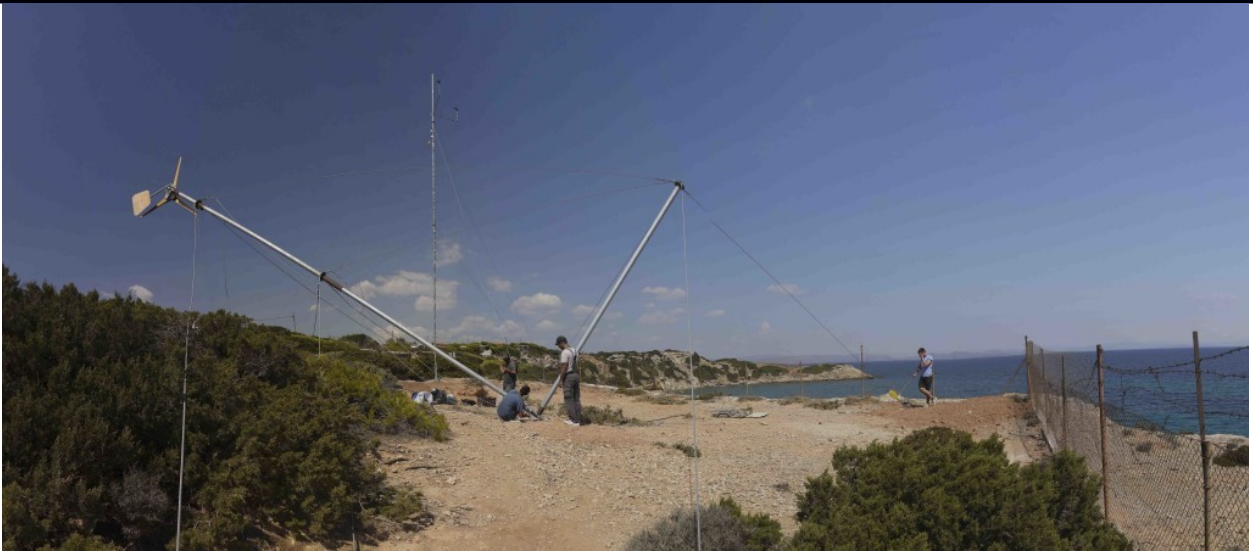
Figure 2: Installation of the neodymium generator at the small wind turbine test site.